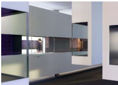
Cleared-out showcases at the Jewellery Museum - visitors are invited to play the role of curators

In the Historical Collection room, visitors and groups assembled by cooperation partners from educational and sociocultural institutions will have an opportunity to slip into the role of curators and compose an exhibition themselves - including jewellery they will have made themselves in workshops, where they can explore and experiment to allow their creativity to unfold, and discover the collection anew.