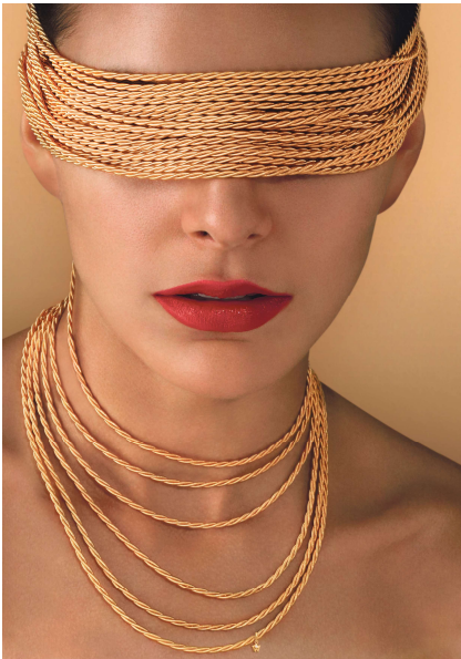
The longest Wellendorff necklace Pforzheim, 2015

Admission € 10, reduced price € 8.50, combined ticket (permanent & special) € 12.50